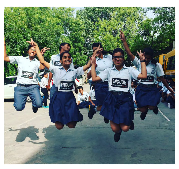
HRIDAY / Healthy India Alliance engaging youth