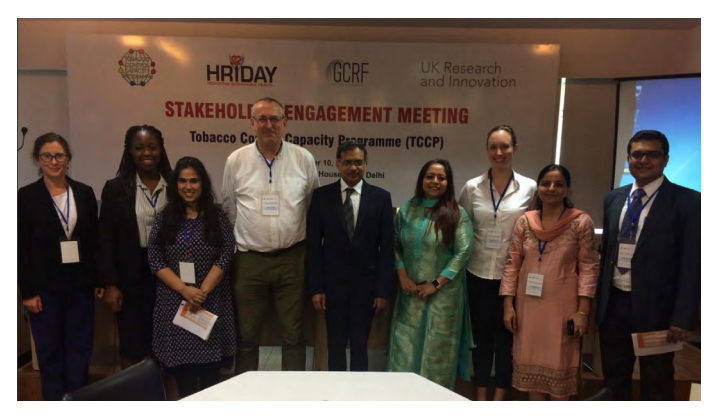
HRIDAY Stakeholder Engagement in India