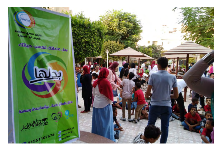
Egyptian NCD Alliance health awareness booth

Gathering and sharing details of local health check or screening services can also be helpful to support early detection of chronic diseases. If you have connections with local health professionals or services, they may be able to join your event to undertake health assessments including surveys and blood pressure checks, and refer people who need further treatment and care advice.