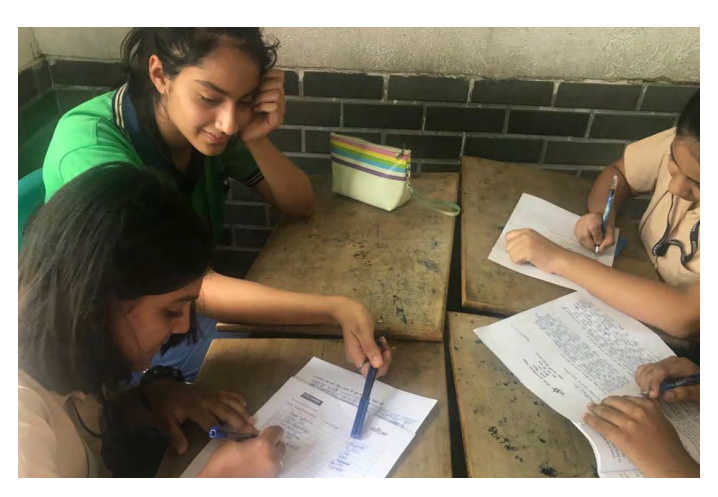
HRIDAY / Healthy India Alliance share a petition

More ideas and inspiration for you to get involved are offered in the Take Action section of the ENOUGH. website.