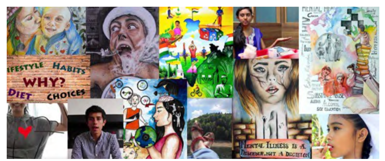
NCD Child Youth Art Competition