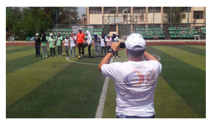
Egyptian NCD Alliance's friendly football game

Do you have a report, article, brief or NCD-related World Day coming up around September? Promote it during the Global Week for Action on NCDs!